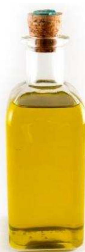
Bottle of olive oil.