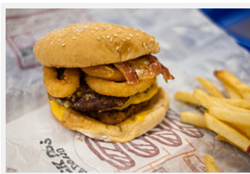
Fast Food

Eating fresh foods, most people intuitively understood, makes the body feel good. A new study, however, actually offers proof of the opposite, finding a link between depression and diets that include processed baked goods and fast food.