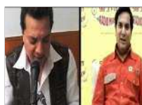
Jatin-Lalit back together?