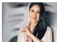
Lakme Fashion Week