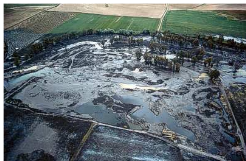
Researchers have compared the Aznalcóllar disaster with the Cretaceous mass extinction.

Using the data on trace fossils and on comparisons with present day disasters, the scientists were able to prove that "the community started to recover fairly rapidly following the mass extinction caused by the impact 65 million years ago, possibly within hundreds or thousands of years", concludes the palaeontologist.