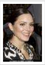
Katherine McPhee at Mercedes-Benz Fashion Week Fall 2009 - Celebrity Sightings in Bryant Park - Day 3