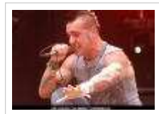
Rev Theory at Rock on the Range 2008 - Day 2