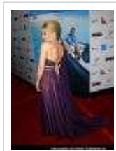
Kylie Minogue at G'Day USA Australia.com Black Tie Gala - Arrivals