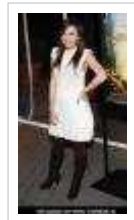
Janel Parrish at "The Spiderwick Chronicles" Los Angeles Premiere - Arrivals