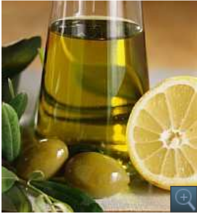
Olive oil contains health-relevant chemicals

Extra-virgin olive oil contains health-relevant chemicals , "phytochemicals", that can trigger cancer cell death, says a new research.