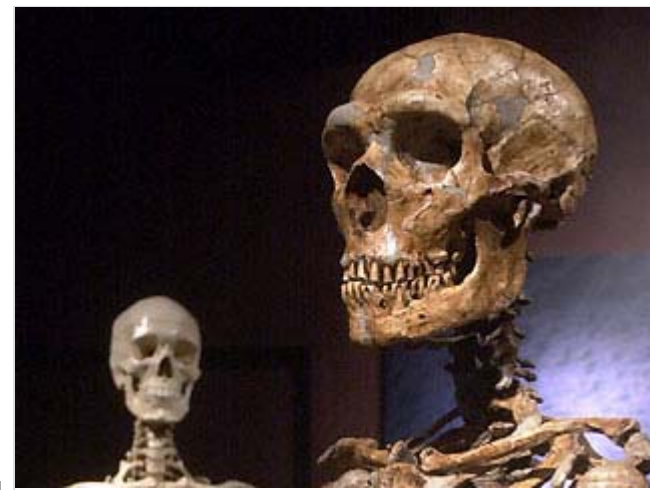
A Neanderthal skeleton, foreground, and a modern human one at the American Museum of Natural History in New York.

Neanderthals disappeared from Earth more than 20,000 years ago, but figuring out exactly why has continued to challenge anthropologists.